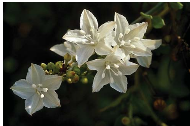
FIG. 1 Flowers of Jacquemontia reclinata (corolla diameter is ~2.5 cm).

The species' range extends along Florida's south-eastern coast on barrier islands from Jupiter Inlet south to Key