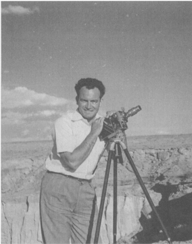
Figure 3. Arizona Portraits.