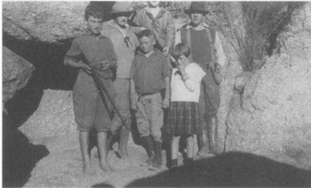
Figure 2. Growing Up Wild.